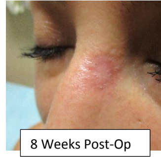
8 Weeks Post-Op

Today, Vaseline and a bandage have been placed over the surgical site to act as a pressure dressing. This helps prevent bleeding and protects the surgical area. Take it easy for at least 24 hours. If you experience any pain or discomfort take over the counter Tylenol as needed. Avoid Motrin, aspirin, Advil, Ibuprofen, or any anti-inflammatory medication. Keep the bandage dry for 24 to 48 hours. If it becomes wet or soiled prior to this, you may change the bandage earlier. Sleep with the surgical area elevated using several pillows when possible. You may begin daily wound care after removing the bandage.