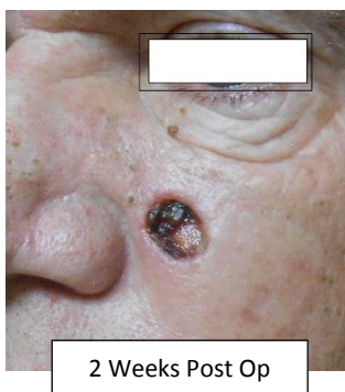
2 Weeks Post Op