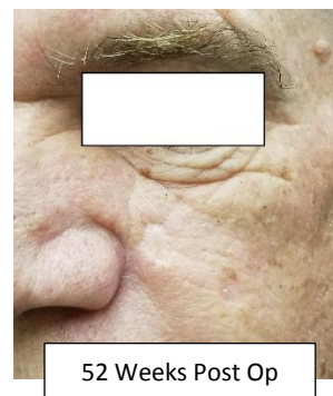
52 Weeks Post Op