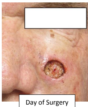
Day of Surgery

Your wound/surgical site will heal best if the surgical area is kept moist and free from scabbing. During the healing process expect to see a formation of granulation tissue. Granulation tissue is new tissue growth that may look pink and or red. This is completely normal and means your body is healing itself.