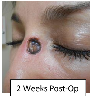
2 Weeks Post-Op